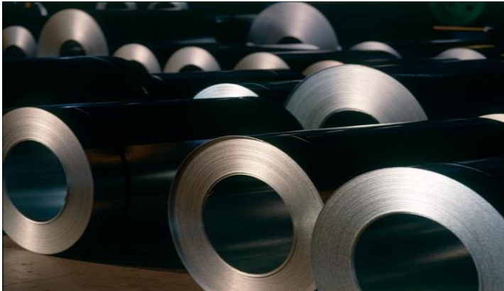
Hot Rolled Coils